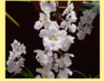
San Diego County Orchid Society's Summer Show in the Park!

Come join us for some fun! July 25th, 2015 - Noon until 5:00pm July 26th 2015 - 10:00 am until 5:00 pm Casa del Prado rm 101 Balbo Park sdorchods.com